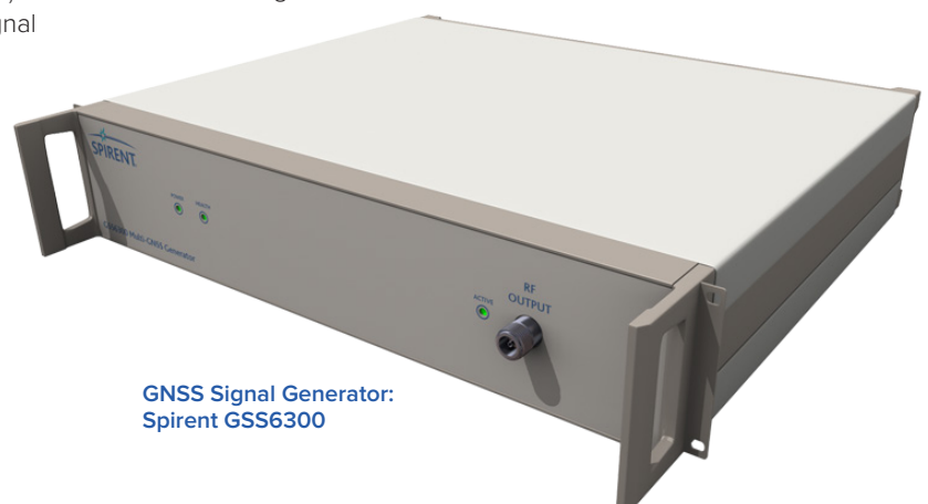
GNSS Signal Generator: Spirent GSS6300

The GSS6300 GPS/SBAS performance is equivalent to Spirent's proven GSS6100 Single Channel Production Test System. In addition, the GSS6300 offers QZSS, GLONASS, BeiDou and Galileo test capabilities to support your evolving GNSS testing needs